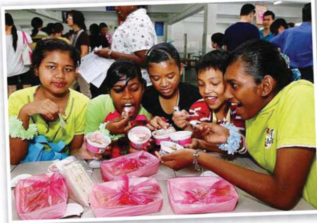
Cool treat: St Joseph's Home children enjoying ice-cream during the Penang Teachers Cooperative Society's Family Day.

Teachers cooperative holds family day with Hawaiian flavour