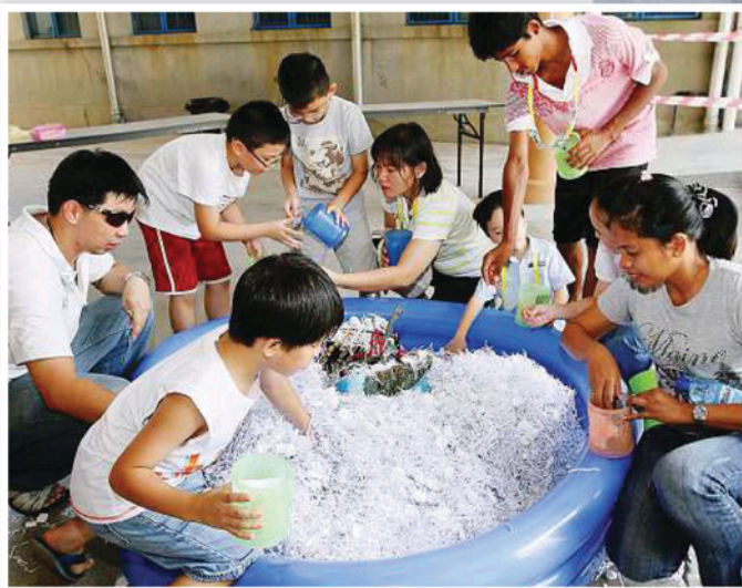
Buried fun: Children having a good time 'digging' for treasure.